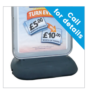
Lower cost, lighter weight base option available for 30" x 40" and A0 sizes. Volume/contract enquiries only.