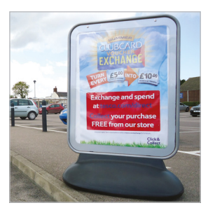
Sentinel® working hard for major retailers across the country.