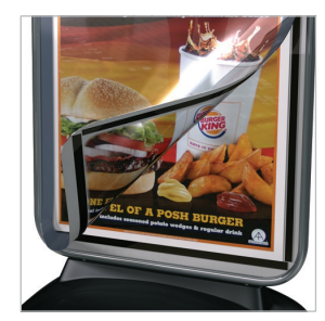
Magnetic poster covers for quick and easy poster change.

Black base as standard to hide dirt and marks.